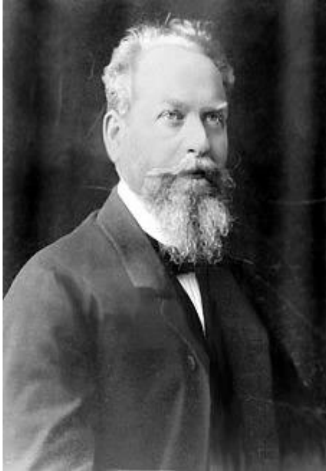
Gottlob Frege 1848-1925